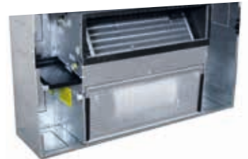
WALL BUILT IN INSTALLATION

The fan coil GEM is the result of a decade of experience in the field of air treatment. Particular attention was paid to make the installation easier, thanks to the inside panels. The design, quiet operation, versatility, reliability, quality of components and the wide range of accessories available, grant excellent performance features both on heating and cooling in any environment. Motors AC/EC.