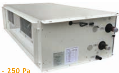
FOHN HP 70 - 250 Pa

PC FROM 2,3 TO 45 KW AT EUROVENT CONDITION