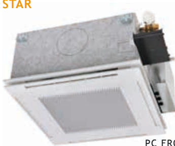
PC FROM 5 TO 10KW AT EUROVENT CONDITION